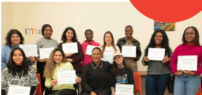
Cohort Graduates - December 2024

women entrepreneurs have been trained (April - December 2024)