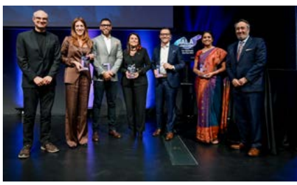
Photo: Awards ceremony at HEC Montréal